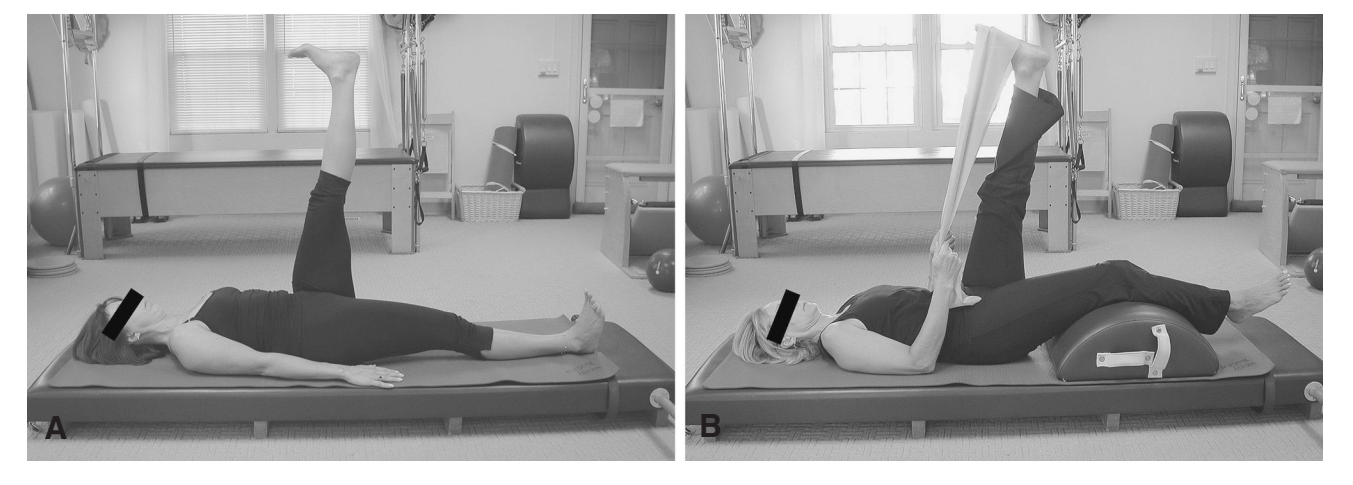
Figure 2 Single leg circles, ideal ( A ) and modified ( B ) positioning. This exercise focuses on hip range of motion and strengthening of the flexor and extensor muscles of the hip, while avoiding active abduction or adduction. Restrictions on flexion and extension can be controlled using the modified version of the exercise seen here.