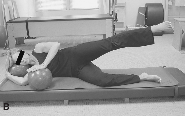
Figure 3 Ideal (A) and modified (B) side kick series (up and down version). This exercise isolates the abductor and adductor muscles of the hip, while engaging the core musculature to stabilize the pelvis and upper body. The benefit of this maneuver is found in enhancing hip range of motion and strengthening the abductor muscles, which can, in turn, improve ambulatory capacity, reduce postoperative limping, and increase hip stability. [The TRIADBALL™ (Zenirgy, LLC. Sun Valley, Arizona) can be useful in modifying these exercises for specific surgeon-based restrictions.]

the adjacent joints and muscles for hip and knee arthroplasty patients (Fig. 3). Benefits of these exercises may be seen with improved balance and gait.